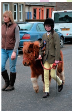
Highland Pony Miniature by Steven Billens