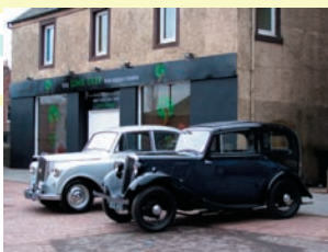
Vintage Cars on display at the Cross, High Street, Coupars Angus during the Horse Fair event.