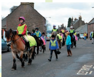
Local Riders and their ponies