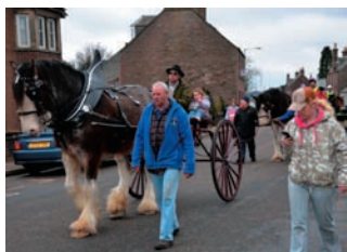
Heavy Horses in the parade