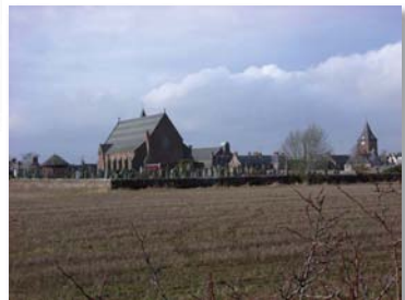
Right: Landmark buildings pierce the skyline above Coupar Angus such as the Abbey Parish Church and the Steeple

Different architectural styles and settings - Above: Georgian Commerical Street Below: Denburn House, Union Street, part of the Victorian expansion