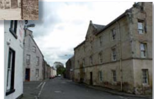
Cumberland Barracks Above: c.1900 Right: present day

Key or significant buildings of a grand scale or historical importance, visible from several locations both near and far